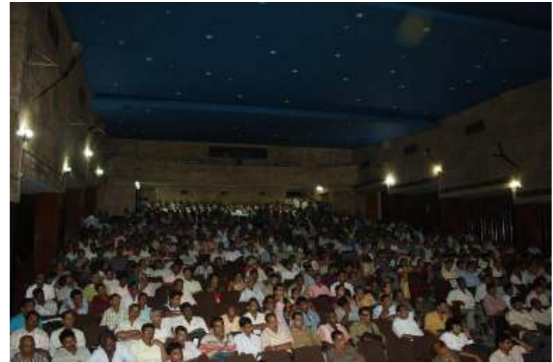
View of the audience