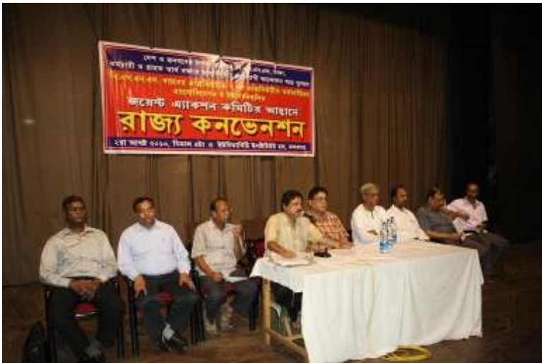
Leaders on dias